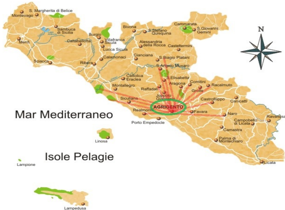
Figure 2: Tourism Spokes from Agrigento

Based on the two field trips that we carried out from the historic center of Agrigento on separate occasions with extremely knowledgeable tour guides, we were able to experience and confirm the existence of significant clusters of cultural, natural and historic attractions that are within a visitor’s reach, as a result of their easy physical accessibility (spokes). These are the assets upon which facilities, amenities, activities and common themes need to be identified, developed and promoted as a market-ready product for the tourist to purchase. In some cases, these attractions need additional assistance to be transformed into deliverable (sold) products to the market. There are other cases, however, where community empowerment and ownership are vital and a necessary element in the process for developing these products. Hence, expert technical assistance is essential to ensure that the creativity and participation of the local community contributes towards the desired ‘product’.