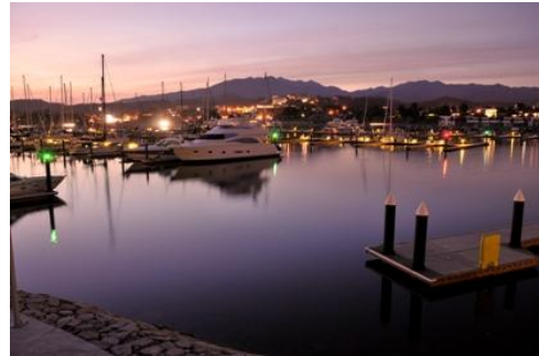
Paradise Village Marina and Yacht Club

The Paradise Village Marina and Yacht Club, located in Nuevo Vallarta, is the first and only certified “Clean Marina” in Mexico. Certified in 2005 by the state of California’s Clean Marinas Program, 270 Paradise Village Marina underwent a thorough review of environmental practices – an evaluation process that costs a modest $500 fee and must be reviewed every five years. To become certified, marinas are evaluated based on a ‘Score Sheet’ where they must fulfill 100% of those best practices that are required by U.S. federal, state, city or port regulations, as well as a minimum of 75% 271 of other non-legally binding good practices.