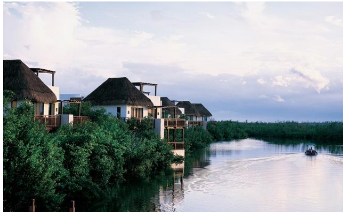
Artificial canals at Fairmont Mayakoba

http://www.rosewoodhotels.com/en/mayakoba/press/press_room/index.cfm/rosewood-mayakoba-recognized-for-sustainable-tourism .