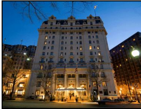
Willard InterContinental Hotel, Washington DC

A no-cost initiative of the hotel has been its travelers' philanthropy program, in which guests are encouraged to contribute between one and five dollars per day to community projects upon checking in. Approximately 70% of guests opt into the program. The hotel has also taken the extraordinary step to calculate the total amount in cost savings from the towel and linen re-use program, and to donate an equivalent amount to watershed protection of a nearby, polluted river.