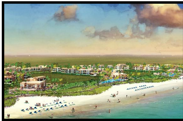
St. Regis Kanai

The third, the Kanai Resort (264 ha), which is to be developed by Mexican real estate developers ALHEL and GIM, had not yet broken ground as of June 2011. However, Kanai has already signed on the hotel brands St. Regis (Starwood) and Park Hyatt (Hyatt Hotels) to manage the hotels once they are built. The hotel plans to open in 2014. 160 Its master plan envisages 847 rooms as well as a system of water canals.