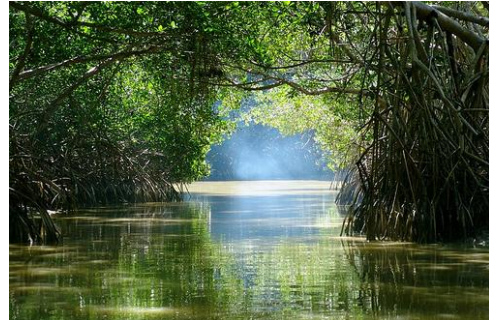
Mangrove along Mexico's coast

A more accurate EIA can help strengthen the cost-benefit analysis too, by zeroing in on the true costs of large scale development. Currently, the cost-benefit analysis does not consider environmental impacts because it is typically conducted before the EIA. Since environmental impacts are a real part of the cost of tourism projects, they should be calculated ahead of time and incorporated into the cost-benefit analysis to determine viability. When selecting a site for large scale coastal tourism development, it is important to consider that converting land in this way precludes other uses in the future that have their own value. FONATUR states that its tourism developments are built to last "100 years or, if properly maintained, indefinitely." 76 That means the land will not be suitable for alternate economic activities for a very long time. Once a site is developed for large scale tourism, it becomes inappropriate for lower-impact nature-based tourism or alternate industries. A forward-looking "highest and best use" analysis is warranted at the outset.