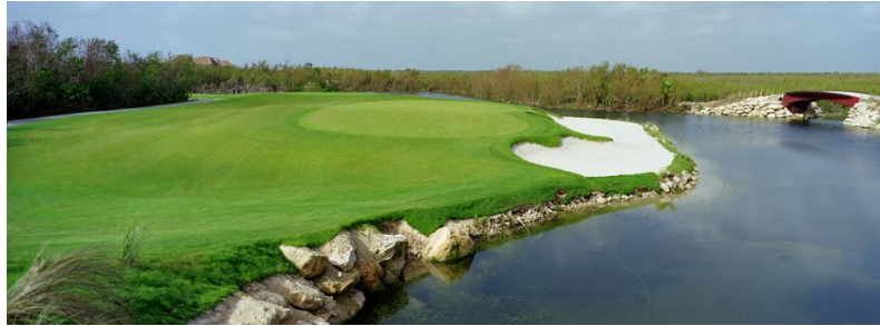
El Camaleón golf course