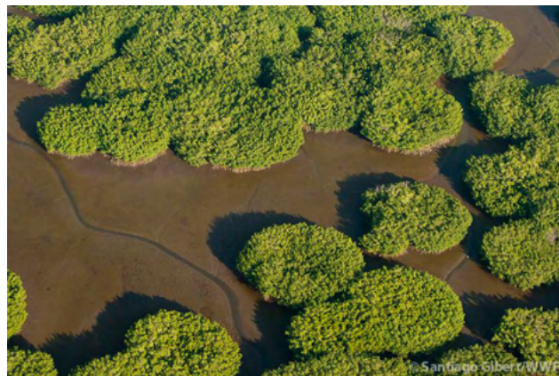
Marismas Nacionales

The environmental condition of the land and surrounding waterways must also be weighed during the site selection and permitting processes. Even though FONATUR may be able to obtain permits to build on a given site in compliance with existing local or federal regulations, international good practice in sustainable tourism development holds that intact high biodiversity habitat is not suitable for construction; neither is degraded land adjacent to natural areas or areas that serve as corridors for migrating wildlife. 62 The Convention on Biological Diversity (CBD), to which Mexico is a signatory, has delineated the importance of buffer zones and corridors as critical to a broad