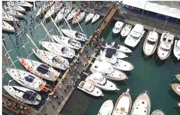
Marina with variety of boats

Marinas may include a range of types of boating infrastructure for leisure and tourism, all under one management. A central component is wet slips, which are berthing spaces designed for mooring individual watercrafts. Berthing is usually provided by a fixed or floating dock connected to land, in a water body of sufficient depth and adequate protection. Marinas can also provide a “dry storage” in a land based facility for storing watercraft or a “drystack”, an onshore storage that holds boats vertically in racks.