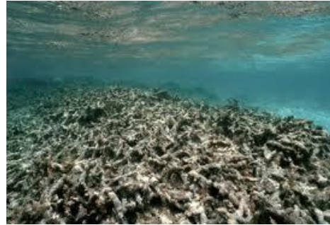
Coral Bleaching

Rising temperatures are the greatest threat to coral reefs, causing coral bleaching, ocean acidification, and, there is strong evidence, increases in infectious diseases in corals. 94 Coral bleaching stress occurs when water temperatures exceed 1.0 °C above the maximum mean summertime temperature, 95 and this is already occurring along the MesoAmerican Barrier Reef and along Mexico's Pacific coast and sea of Cortes, with impacts likely to increase over time. 96