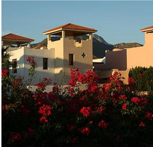
Courtyard Homes, Villages of Loreto Bay

There are a handful of luxury residential tourism projects in Mexico that incorporate components of environmental and social sustainability. One is the Mayakoba vacation homes that are part of the Mayakoba resort complex 223 in the Riviera Maya; another is the Pedregal Cabo San Lucas, which is billed as “the first luxury Green Home in Los Cabos” using LEED guidelines and as contributing a portion of its “proceeds will go towards GREEN FOUNDATIONS and spine injury foundations.” 224 A new project still in the design and early development stage, is Amaitlan, located on a 2400 ha. peninsula in Mazatlan in