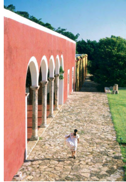
Las Haciendas

In 2002, following Hurricane Isidoro which caused great devastation in the Yucatan, Grupo Plan’s social commitment to Mayan communities increased exponentially. To develop self sustainable development projects, Grupo Plan created the Fundación Haciendas del Mundo Maya, 172 a nonprofit organization whose mission is to “create actions which foster the identity, recognition and rescuing of the expressions within the Mayan cultural universe, overcoming extreme poverty by furthering education, health, and sustainable development opportunities while involving the local population as promoters of their own social projects” 173 The Foundation has contributed to the preservation of traditional medicine and cultural cuisine and the creation of jobs using Mayan handicraft skills that were being lost with the passing of each generation.