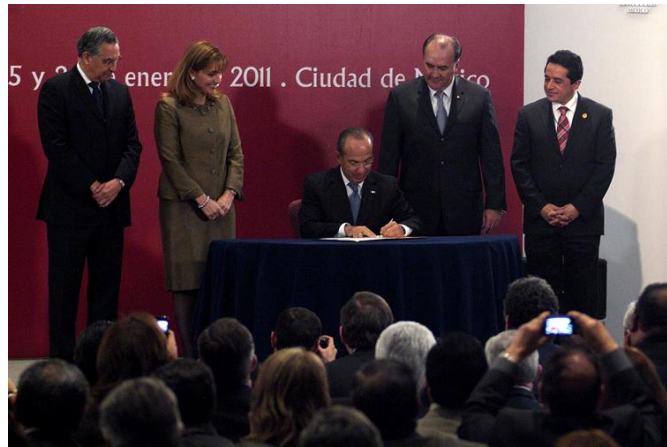
President Felipe Calderon signing the National Accord for Tourism

Since 1995, Mexico's global ranking for tourism arrivals has gradually fallen, even though overall, the number of international visitors has grown modestly, from about 20 million in 1995 to just over 22 million in 2010. But as global travel has rapidly expanded, Mexico's ranking among other countries has steadily slipped, from 7 th in the world in 1995 and 1996, to 8 th in 1998 – 2000, to 10 th in 2010. 5 Mexico's global ranking for international tourism receipts has also fallen, despite an upward trend in international receipts per tourist arrival. In 1990, Mexico was ranked as 10 th in international tourism receipts; however, in 2010, Mexico had dropped significantly to 23 rd place, behind, for instance, Turkey, Canada, Hong Kong, and Greece. 6