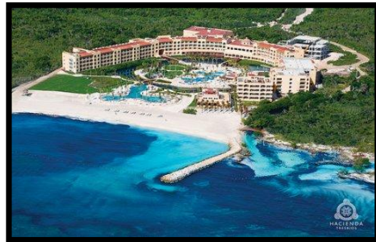
Hacienda Tres Rios