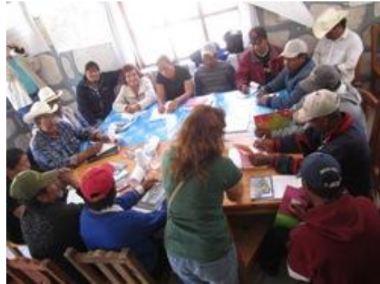
Indigenous Tourism Workshop

Tourism projects and their visitors inevitably impact the surrounding community. It is the responsibility of FONATUR and private developers to consult with the community to mitigate negative impacts and to maximize the development's benefits to and acceptance by the surrounding community. If community members are not involved early on, important considerations may be overlooked and these could be costly to address at a later stage. Establishing a