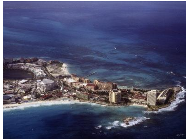
Aerial View of Cancun

Unfortunately, FONATUR (with SEMARNAT's approval) has often chosen coastal locations where large scale tourism development has caused environmental and social damage. The first five CIPs (Cancún, Los Cabos, Ixtapa, Loreto, Huatulco) were selected before many of the internationally recognized good practices for sustainability had emerged. The sites were viewed as blank slates with natural beauty and without significant existing populations, so scant care was taken to protect fragile ecosystems. Cancún is located on naturally wide beautiful white sandy beaches, turquoise waters, an abundance of coral, and a lagoon that is home to a wide variety of indigenous species. "The resulting tourist industry," states a study on coastal development, "extensively damaged the lagoon, obliterated sand dunes, led to the [local] extinction of varying species of animals and fish, and destroyed the rainforest that surrounds Cancún." 53 Another study found that the scale of development also damaged Cancun's underground water systems. 54 FONATUR's mega-resort development in Huatulco "accelerated the process of social and spatial polarization, impoverishing the native populations and raising tensions throughout the region." 55