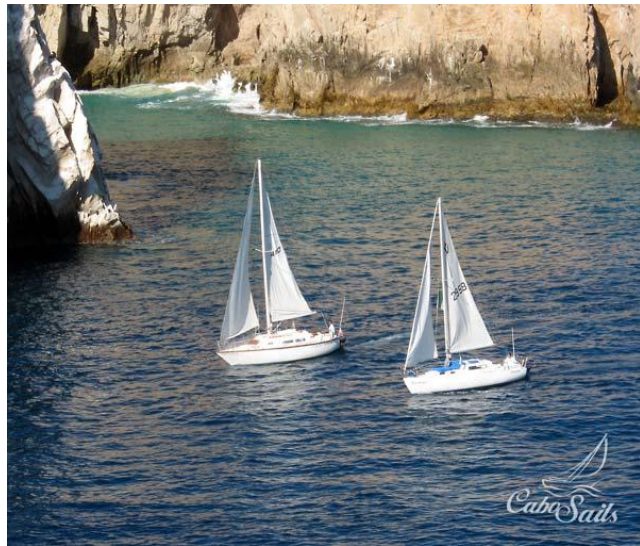
Sailing near Los Cabos

Despite this innovation, a coalition of international organizations, environmental lawyers, and grassroots groups, tried to stop construction of the Puerto Los Cabos Marina, arguing it would cause environment damage to the estuary, consume large quantities of scarce fresh water, create huge waste issues, and dislocate a number of local communities. Opponents of the project state that many of the town's former residents sold out and have moved away. In 2006,