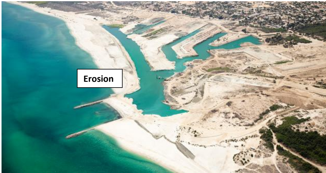
Cabo Riviera Marina and Resort, Phase 1: April 2011 245

Just south of here, an even more massive project, Cabo Cortes, includes plans for a major marina for 490 wet slips, three golf courses, and 27,000 hotel rooms -- almost as many as Cancún has today and almost three times as many as currently in Los Cabos. Cabo Cortes is, however, being opposed by a coalition of environmental organizations and local residents who charge it will consume 100% of the fresh water in the area's one healthy aquifer, destroy virgin sand dunes, and damage the Cabo Pulmo National Marine Park, which is described as "the world's healthiest marine reserve." In early 2011, SEMARNAT quietly gave the Spanish development conglomerate, Hansa Urbana, the green light to begin construction; however, in late 2011 it ruled that construction can only begin if the developers can prove by January 2013 that the reef will remain unharmed. In the wake of the European debt crisis, the financially ailing Hansa Urbana turned over ownership of the project to a Spanish bank, leaving in doubt who actually controls the mega-marina-resort project. 246