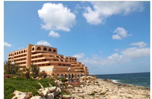
Radisson Blu Resort & Spa, Malta Golden Sands

In 2003, the owner of the Golden Sands located on the island of Malta off Italy took the unprecedented decision to completely rebuild the resort to conform to internationally recognized good practices in sustainable siting, design, and construction. The owner, Island Hotels Group, worked closely with the Malta Environment and Planning Authority to ensure that the property and landscaping would be more sensitive to its surroundings and that environmental considerations were fully integrated into the resort.