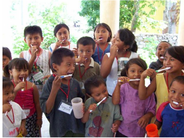
Foundation Haciendas del Mundo Maya supports public health education, Credit: Fundación Haciendas del Mundo Maya

2. Promotion and Strengthening of Educational Services: Between 2003 and 2011, the Foundation helped to build six community libraries and five educational spaces, bringing educational activities to 11 communities, a total of 56,080 people. Programs offered have included continuing education, computer services, internet access, reading rooms, Mayan cultural heritage, and artistic activities. Adult literacy programs were developed in six communities and cater to the needs of over 500 people, while parenting schools are run in ten communities, resulting in improved family cohesion. For those communities without a library, the Foundation provides a mobile library that serves the needs of nearly 4,000 children, lending 19,667 books between 2008 and 2011.